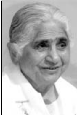
Rajyogini Dadi Janki Ji

Nowhere in the world, nor throughout the whole cycle, will you find people as happy as we BK's are. Now we realise the value of what Shiv Baba is giving us. In the evenings especially we get the feeling of 'who I am' and 'who is mine'. All the good