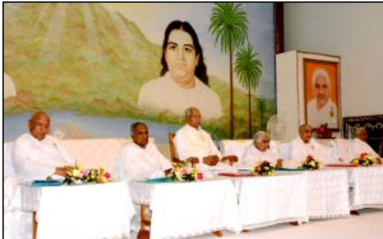
Leading Lights of Rajyoga Meditation: Revered Dadis, Senior Brothers, Zonal Heads, Sub-Zonal Heads, Chairpersons-ViceChairpersons-National Coordinators-HQ Coordinators of all Service Wings, and other Seniors of Brahma Kumaris Institution at the Annual Service Meeting held in Shantivan Campus from 8-15 April 2016.

This may perhaps be the easiest and most cost-effective solution to bring about the required uplifting change in attitude, awareness, approach, vision in our interactions with other humans and living beings.