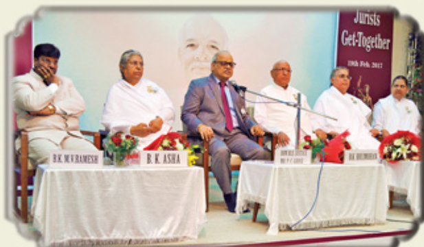
Delhi (Pandav Bhawan): Justice P.C. Ghosh, Hon'ble Judge of Supreme Court is addressing a seminar for Jurists on 'Transforming Stress into Happiness'. BK M.V. Ramesh, BK Brijmohan, BK Asha, BK Pushpa, BK Lata are also sitting on the dais.