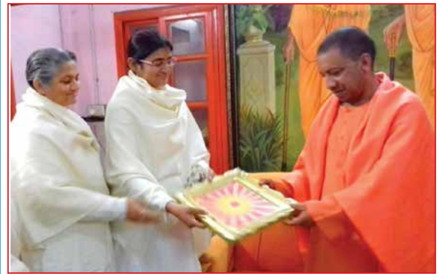
Gorakhpur, Uttar Pradesh : Yogi Adityanath, Hon'ble Chief Minister, being presented a frame of Incorporeal Shiva by Brahma Kumari Sisters.