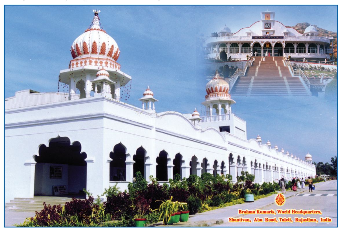
Diamond Hall at Shantivan Abu Road Campus and Om Shanti Bhawan (inset) at Brahma Kumaris headquarters, Mount Abu. There are over 4,500 campuses of the Godly University in India and 137 countries abroad.

When someone graduates from a worldly university, they earn a qualification or a degree which brings them short-term returns. Anyone passing out from this Unique Godly University reaps the fruit for many births to come.*