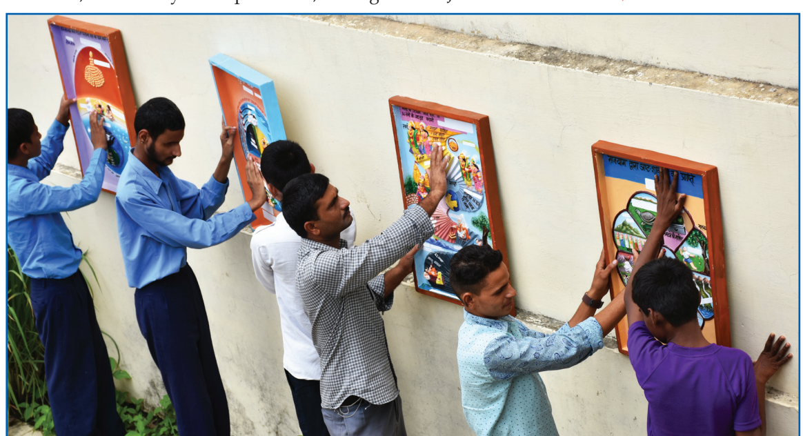
Mount Abu, Rajasthan: Students of Blind School learning spiritual knowledge through 3D models displayed by Divyang Seva Cell of the Brahma Kumaris.