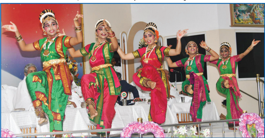
Cultural performance during Administrators' Conference, Manmohini Complex, Abu Road.