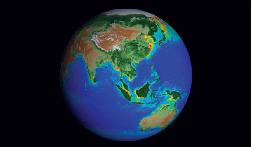
Mother Earth - the only planet in the universe which sustains life.