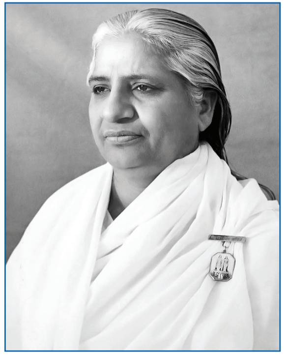
Jewel of Light To Angel of Light