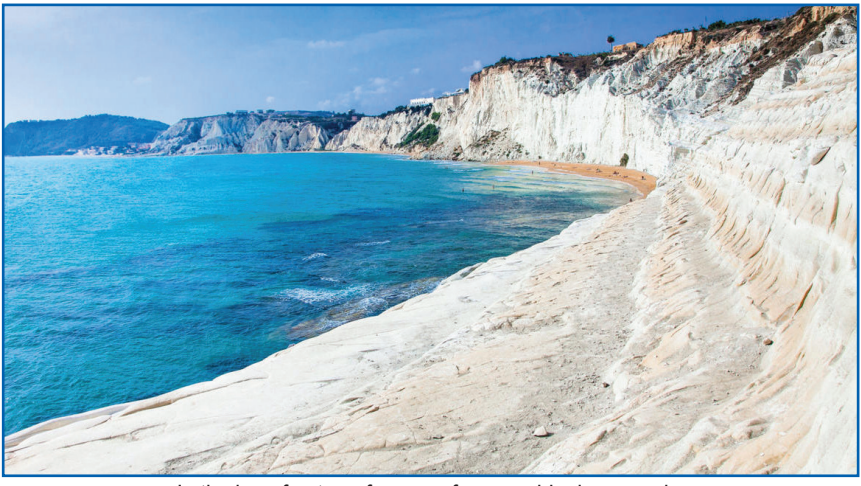
In the lap of nature, far away from maddening crowds.