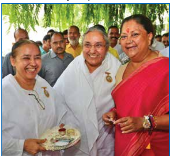
Hon'ble Chief Minister of Rajasthan Vasundhara Raje.