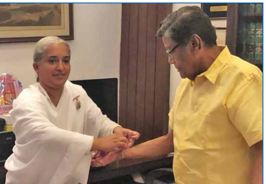
Attorney General of India K.K. Venugopal.