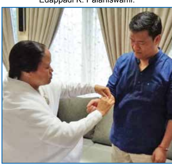
Hon'ble Chief Minister of Arunachal Pradesh Pema Khandu.