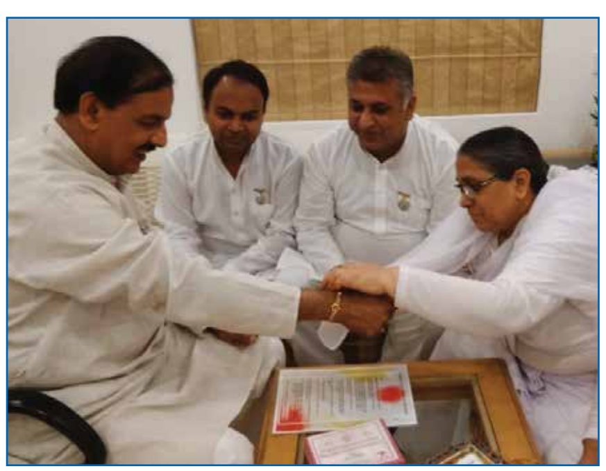
Hon'ble Culture Minister of India Dr. Mahesh Sharma