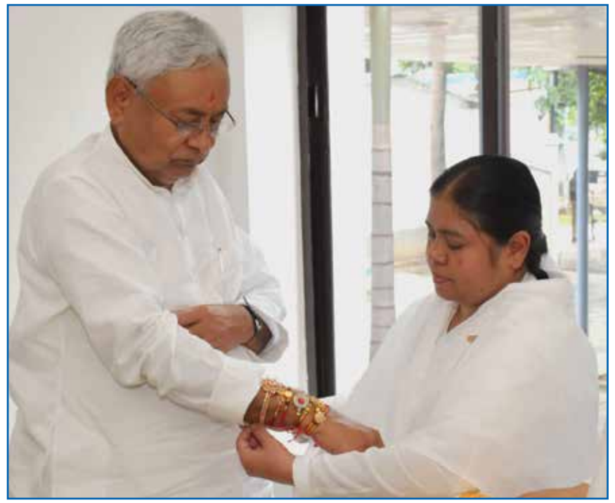
Tying 'Rakhi' to Hon'ble Chief Minister of Bihar Nitish Kumar.

Spirituality helps transcend all limits and enables me to have love and concern for everyone. But, the question arises; is it possible to teach young people these things? It is not just a question of the young, but whoever I am, I need to make that journey inwards and connect with the Divine to allow inherent compassion to open up. When I am in touch with my own dignity then I can see the dignity in others and healing energy flows. When there is the self-esteem of spirituality, discriminatory behaviour ceases and only love and well-being is visible.