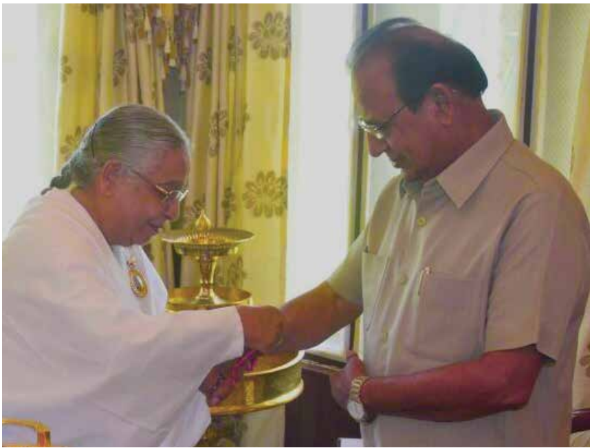
Hon'ble Governor of Assam Jagdish Mukhi.