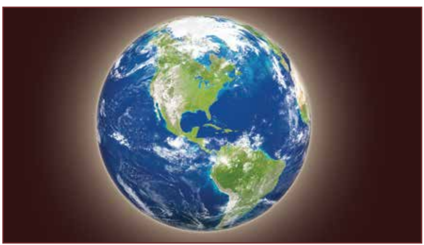
Mother Earth - The only planet in the universe which sustains life.

ecosystems. Since plankton are the food of fish, abundant fish populations often live where these currents prevail.