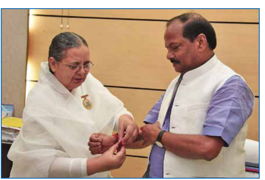
Hon'ble Chief Minister of Jharkhand Raghubar Das.