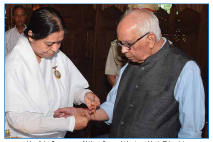
Hon'ble Governor of West Bengal Keshari Nath Tripathi.