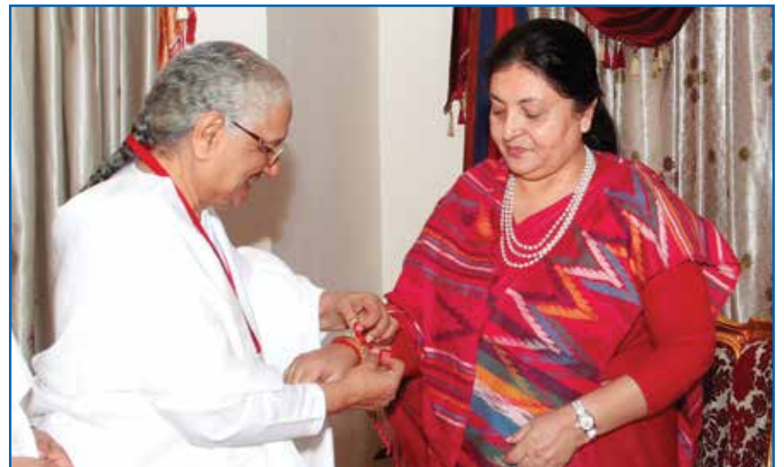
Hon'ble President of Nepal Bidhya Devi Bhandari.