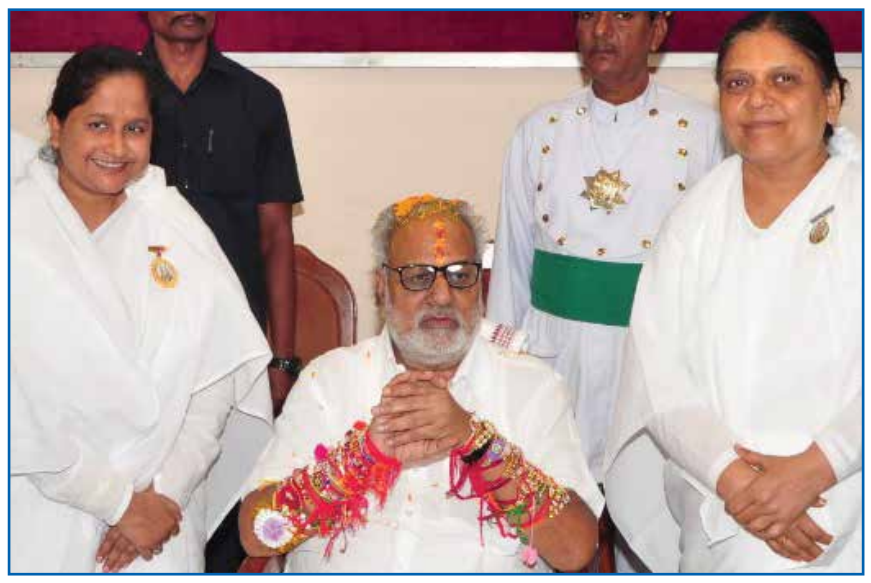
Hon'ble Governor of Odisha Prof. Ganeshi Lal.