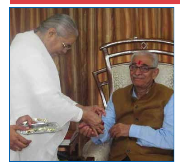
Hon'ble Governor of Gujarat Om Prakash Kohli.