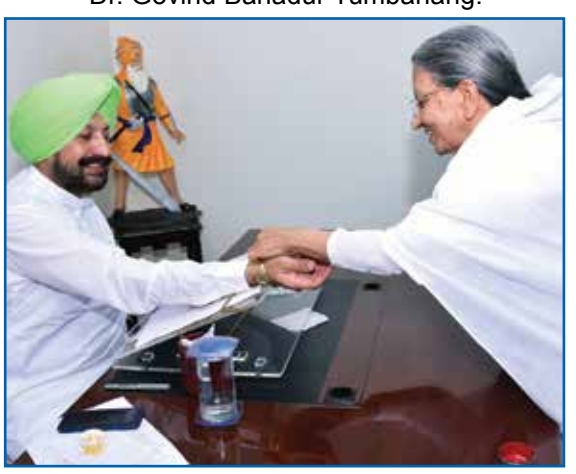
Hon'ble Punjab Minister for Animal Husbandry, Dairying & Labour Balbir Singh Sidhu at Mohali.