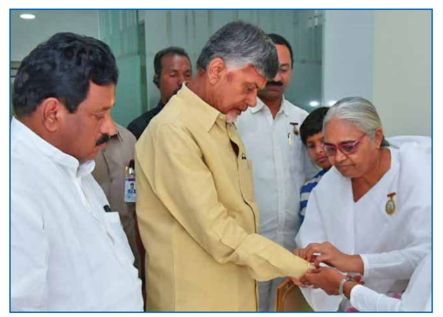
Hon'ble Chief Minister of Andhra Pradesh N.Chandrababu Naidu.