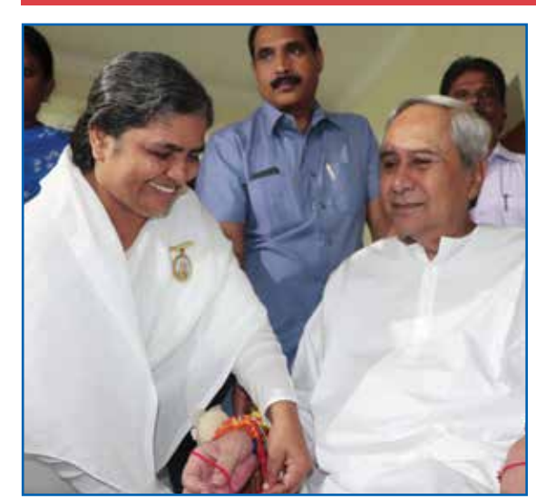
Hon'ble Chief Minister of Odisha Naveen Patnaik.