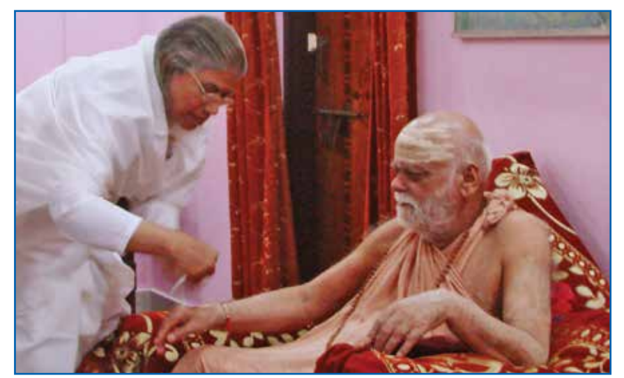
Shankaracharya Swami Nishchalananda Saraswati of Puri.

NGO OF UNITED NATIONS IN CONSULTATIVE STATUS WITH ECOSOC & UNICEF. OVER 4500 ASSOCIATE CENTRES IN 137 COUNTRIES.