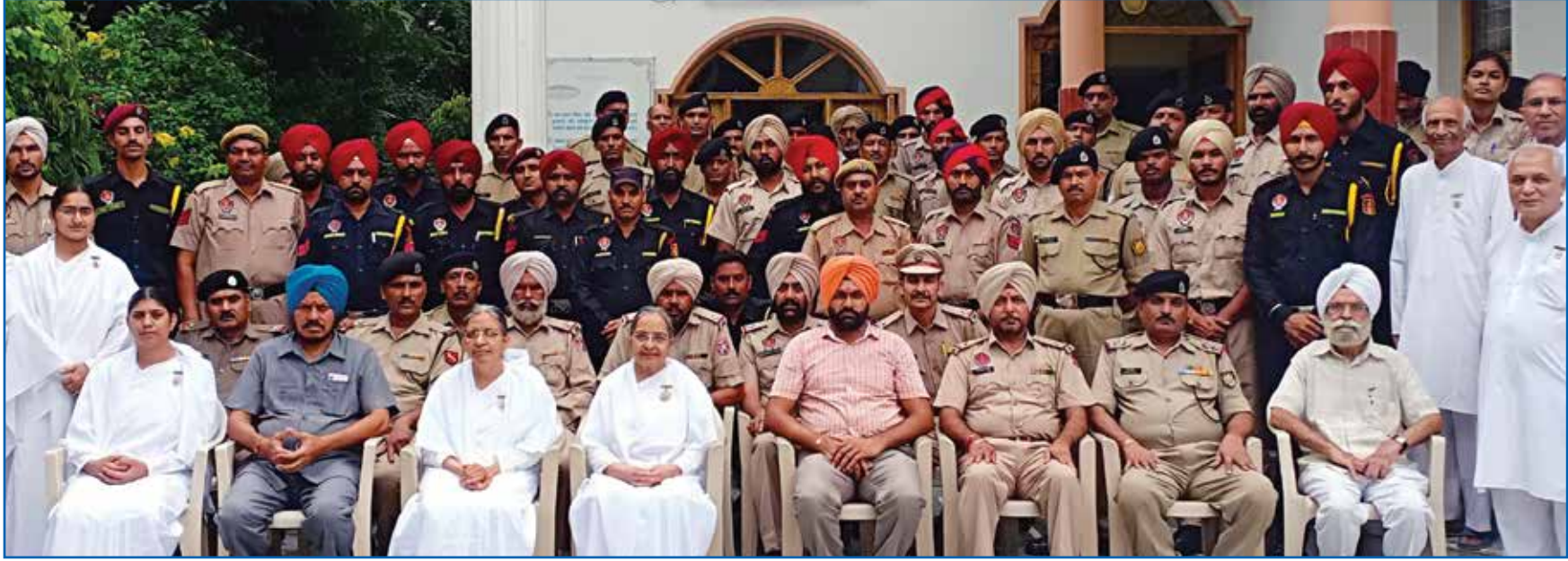
Mohali, Punjab: Group photo of Jawans and Officers of BSF, Commandos and Punjab Police, who celebrated 'Raksha Bandhan' at Brahma Kumaris Sukh Shanti Bhawan.

More Raksha Bandhan Pictures in next Purity.