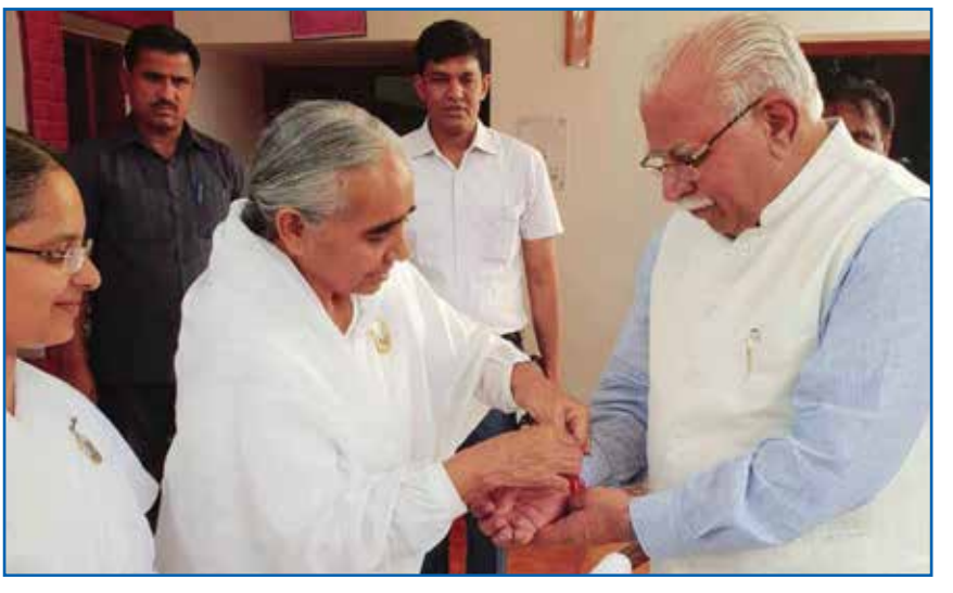
Hon'ble Chief Minister of Haryana Manohar Lal Khattar.