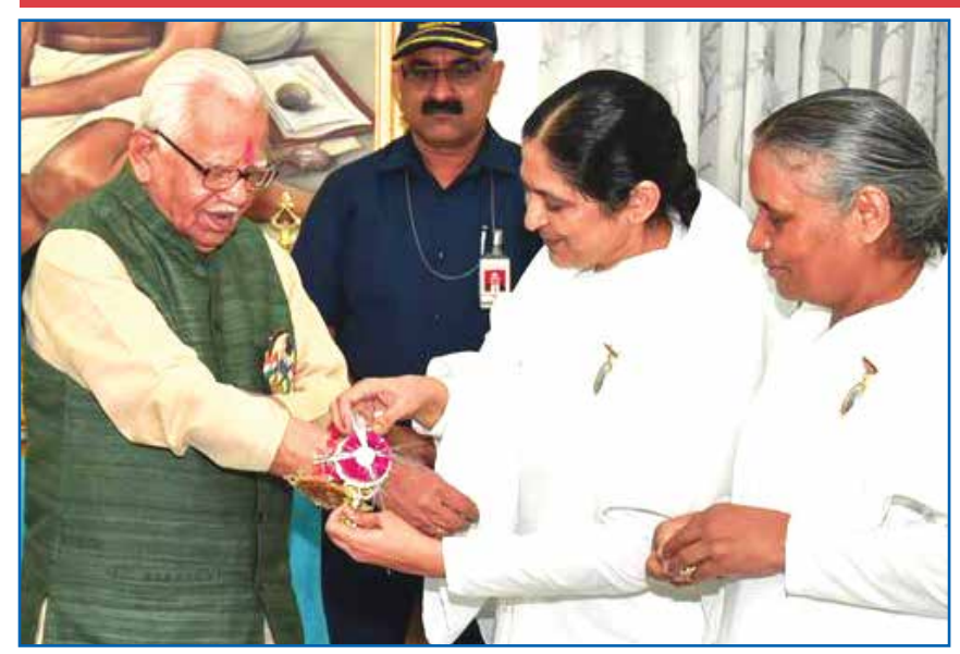
Hon'ble Governor of Uttar Pradesh Ram Naik.