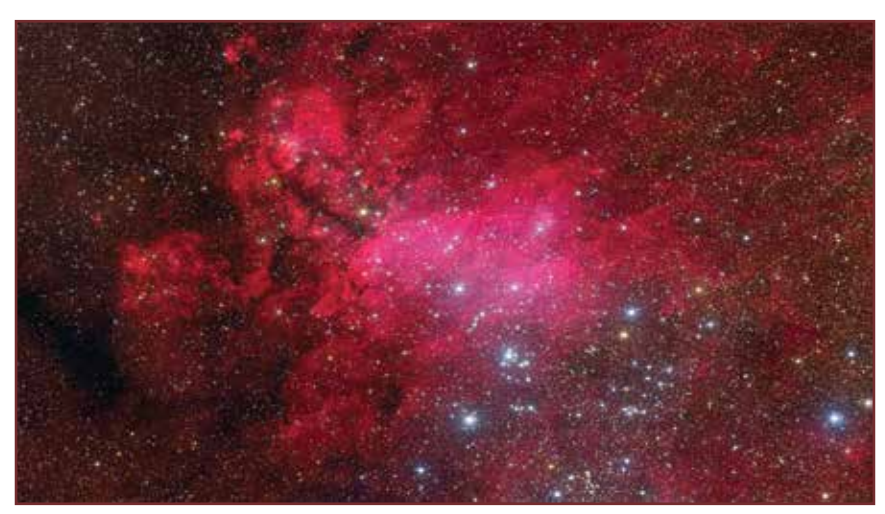
Conditions on no other planet in the cosmos has conditions to sustain life.

Ocean currents affect temperatures throughout the world. Cold ocean water currents flowing from polar and subpolar regions bring in a lot of plankton that are crucial to the survival of key species in marine