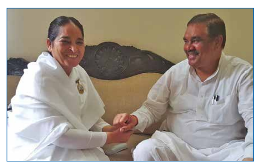
Hon'ble Union MoS for Social Justice and Empowerment Vijay Sampla.