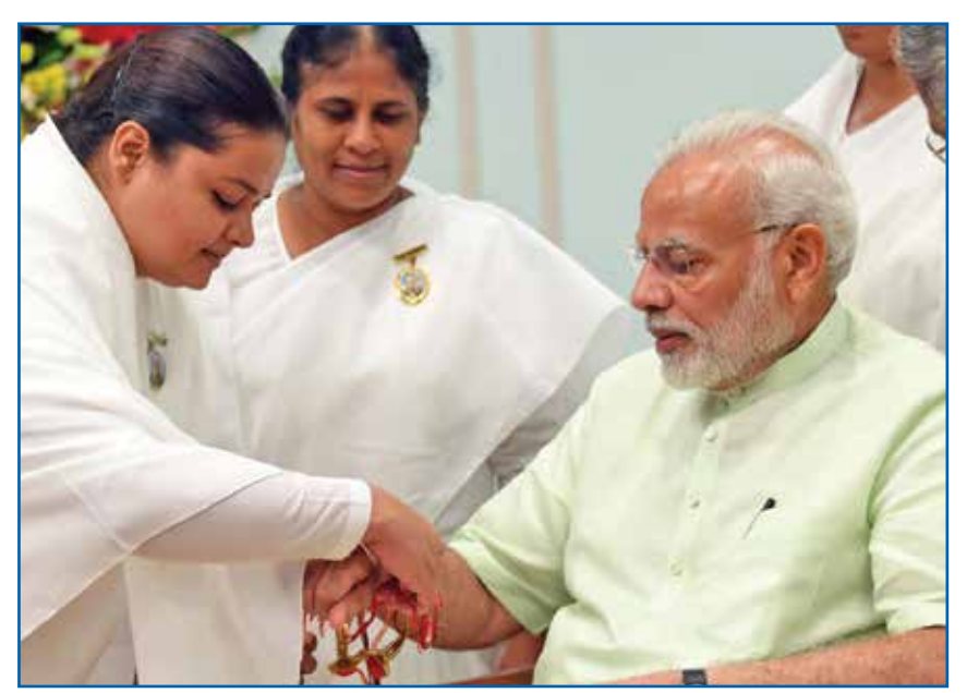
Hon'ble Prime Minister of India Narendra Modi.