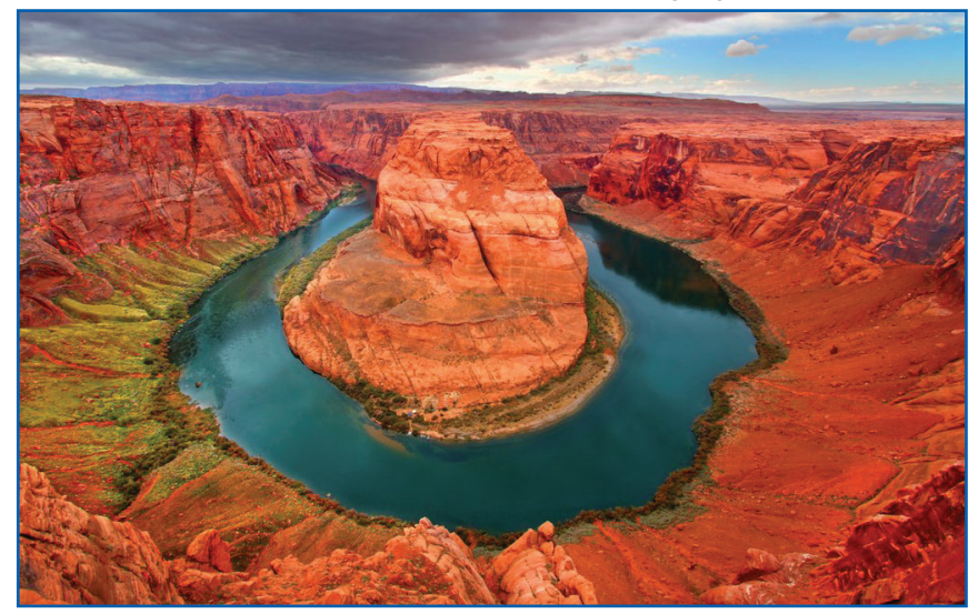
The Colorado River Region begins in the Rocky Mountain National Park.