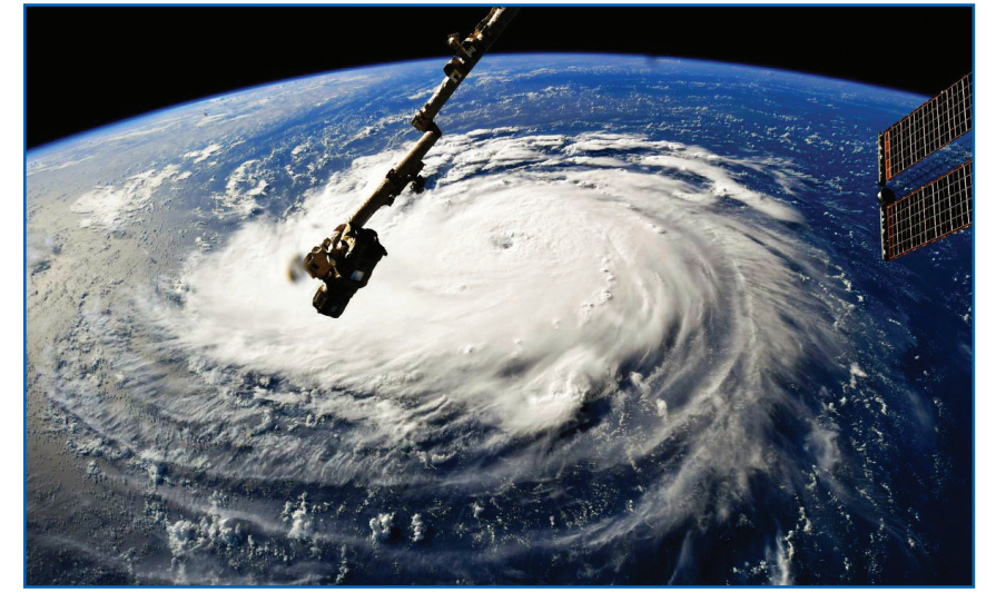
USA: Hurricane Florence, category 4 hurricane which affected the states of North Carolina, South Carolina and Virginia as seen from International Space Station.