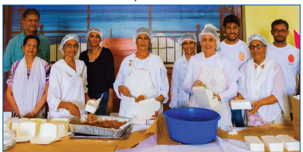
Trinidad & Tobago : Chaguana Rajayoga Centre preparing food boxes for distribution among flood victims in cooperation with Monroe Road Hindu Temple.