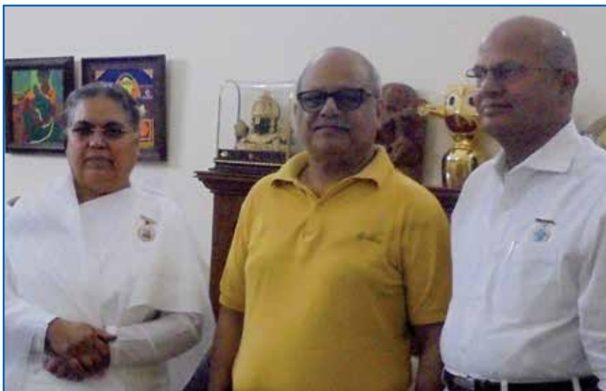
Pandav Bhawan, New Delhi: The first Lokpal, Hon'ble Justice P.C.Ghose, former Supreme Court judge (middle) with Justice V. Eswaraiah, former Acting Chief Justice of Andhra Pradesh High Court, and BK Sister Pushpa.

the language of silence, which is the language of God, we'll know how to get along with people, how to bring out the love for everyone, how to give benefit to the people who work with us. And if we can create a different context, then we can start to believe that human beings can change the world. We need to do something more than just live our lives. If something valuable touches you, start nurturing it like a seed; give it the light of understanding, the water of love and care, the soil of values in which it can grow, the time of patience and the space of freedom to move, and you'll have a beautiful world—both inside and outside.■