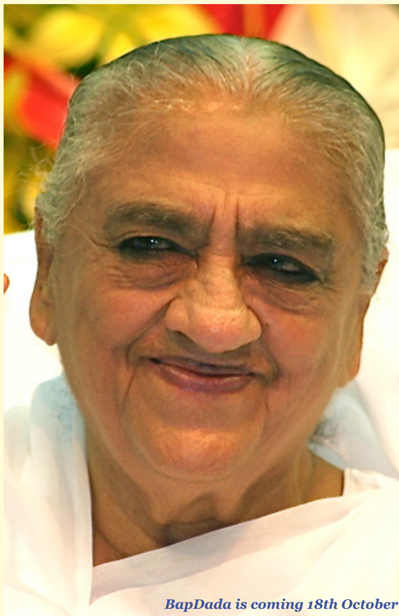
BapDada is coming 18th October