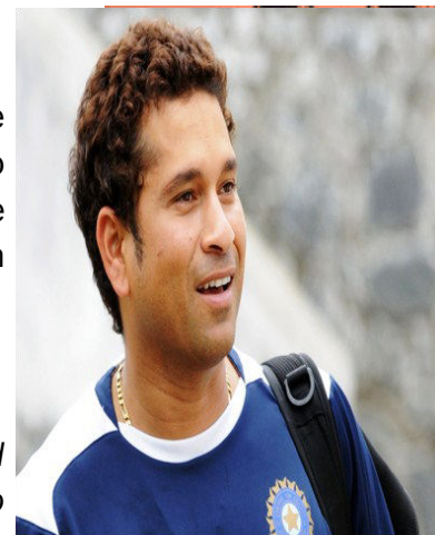
A living Book to read and learn