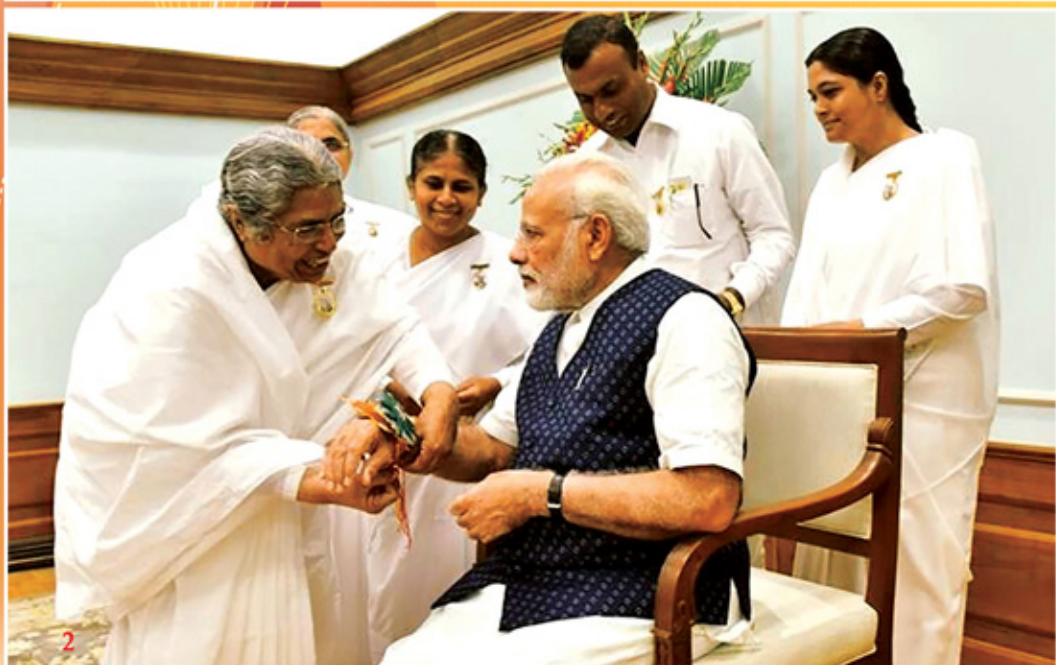
1. New Delhi : After tying Rakhi B.K. Sapna is applying tilak to H.E. Ramnath Kovind, Hon'ble President of India. 2. New Delhi : B.K. Asha is tying Rakhi to Mr. Narendra Modi, Hon'ble Prime Minister of India.