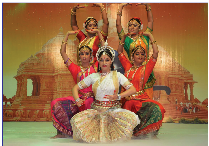
Bollywood actor Gracy Singh and group perform during the 25th anniversary celebrations of Global Hospital & Research Centre in Diamond Hall, Shantivan, Abu Road.