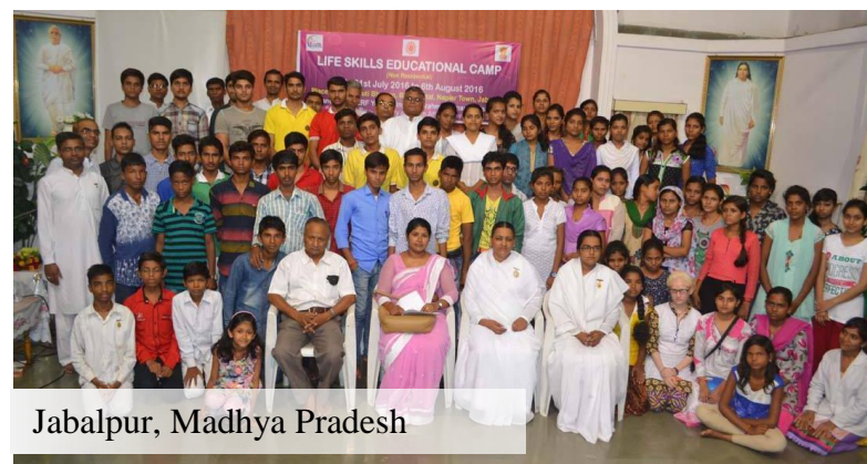
Jabalpur, Madhya Pradesh