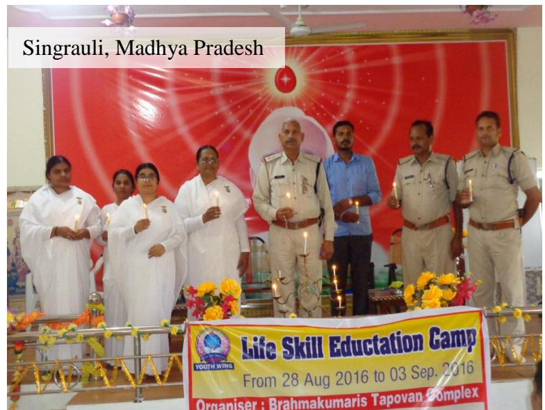
Singrauli, Madhya Pradesh