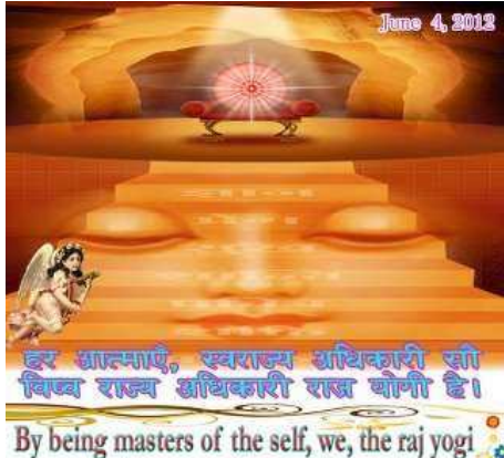
By being masters of the self, we, the raj yogi souls, become masters of the world...

Hum atmaayen swarajy adhikaari so vishv rajy adhikaari raj yogi hain. ..