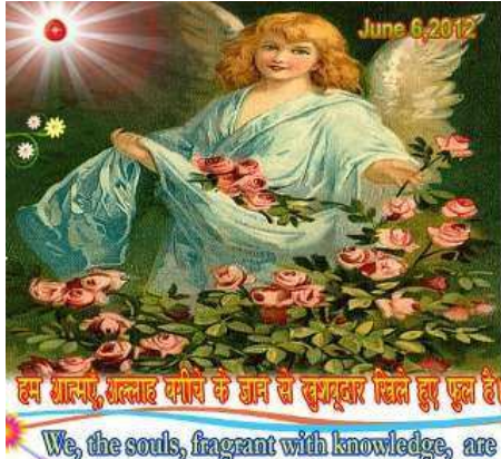
We, the souls, ingent with knowledge, are

Hum atmaayen, Allah ke bagiche ke gyan se khushboodaar, khile hue phool hain. ..