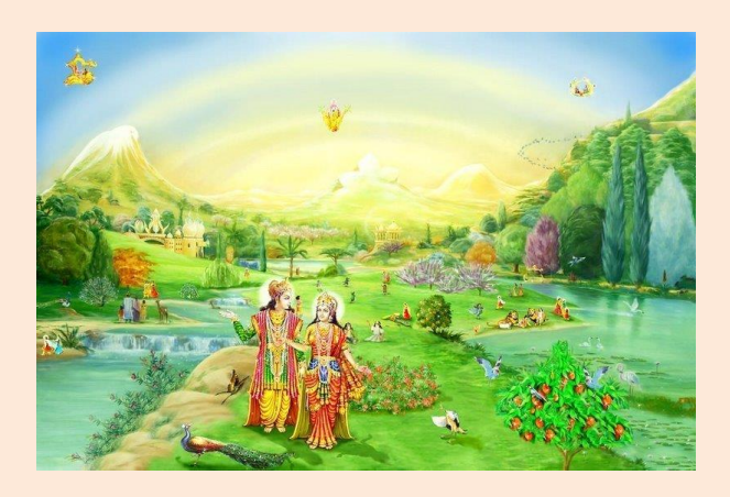
HEAVENLY DEITY WORLD - SATYUGA