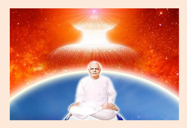
then "Kesari ( Saffron) " means the color of the supreme abode.

Everything is there in it. Why do we call green color for greenery? When trees and plants grow on the earth, there is greenery, trees and plants all speak the beauty of nature. The subtle region in the middle and Kesari above because the supreme abode is of such color. That's why it is called three colors "tricolor". And who is sitting in the middle of the wheel is "My Baba" who is the formless point light form. Everything is connected.