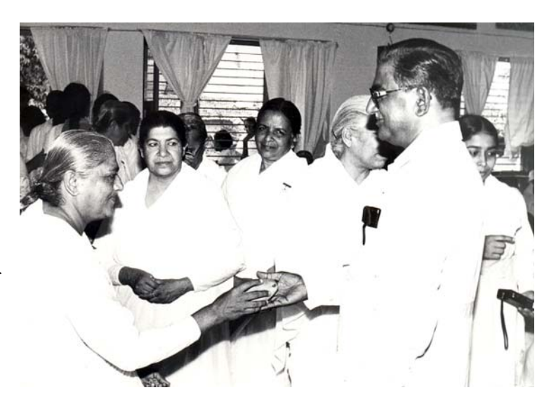
Unlce and Aunty meeting with Avykt BapDada

She took with her smiles, and she gave with her smiles. Her smile took all our mental and emotional burdens and burnt them with the fire of her love leaving us free and light. And her smile relaxed our minds