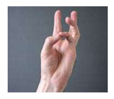
Emotional / spiritual use

The tips of the pinky finger and thumb touch.