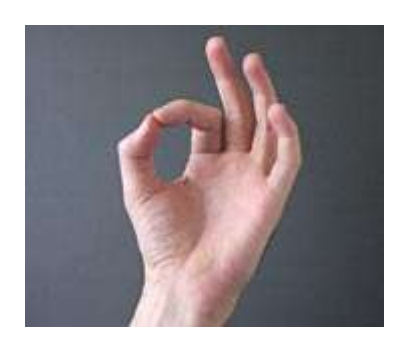
Emotional / spiritual use

Stimulates the Root chakra, and grounds. Calms and improves concentration.