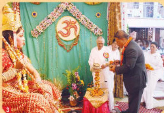
3. Kathmandu (Nepal) : A live tableau of Goddess Navdurga being inaugurated by Mr. Prakash Mansingh, Hon'ble Dy. P.M. of Nepal.