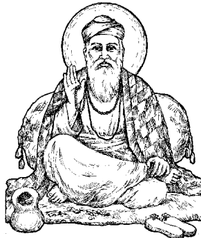
Guru Nanak Dev ji

another to represent the form of Light that God is. All over India, the images of the form that Shiva has are found installed; these images are without any human form, in the form of linga , which